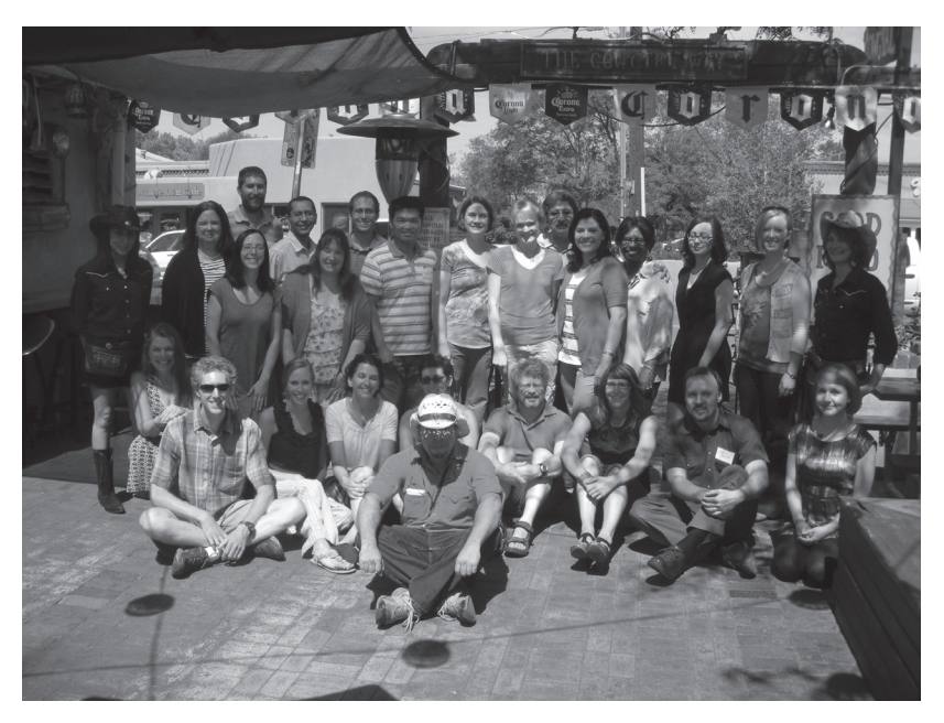
NCWAC 2012 Summit Group

I first publically recounted the catalyzing moment of becoming an advocate of community writing in the climate of radical intimacy at the 2012 Summit of the National Consortium of Writing Across Communities (NCWAC) in Santa Fe, New Mexico on July 15, 2012 (Writing Across Communities Resource Site). In the rustic, wood-plank banquet room of the Cowgirl BarBQ on Guadalupe Street in historic Santa Fe, the city of "blessed faith," a group of thirty junior and senior scholars from across the nation deliberated together for three days about the role of community writing in the field of Composition Studies.