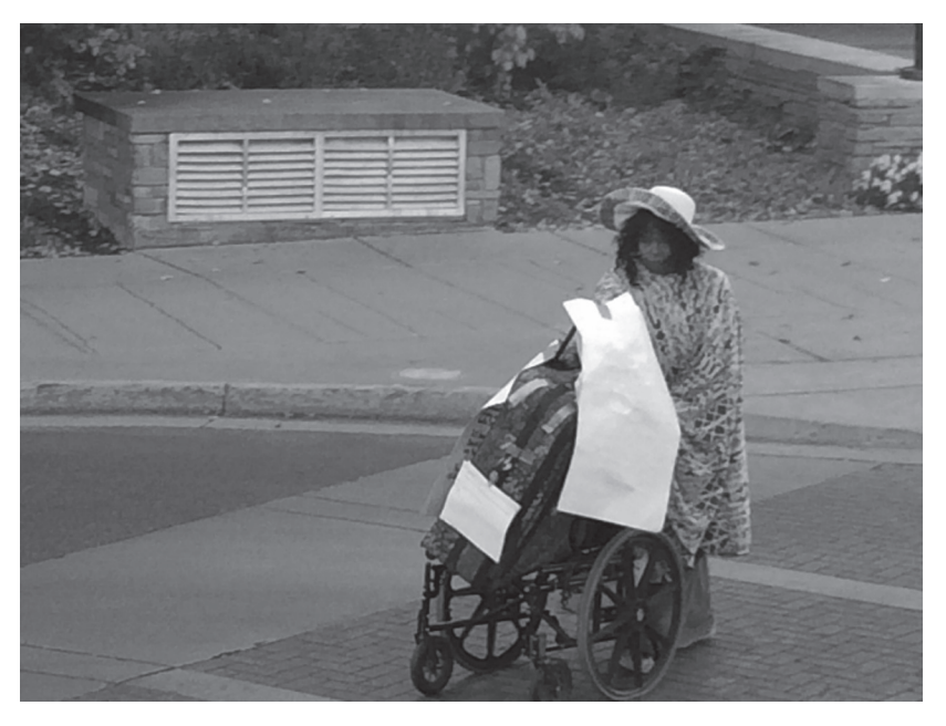
Homeless Woman at UC Boulder Community Writing Conference

who was taping electrical cords to the floor of my conference room. I invited him to join our workshop, which he enthusiastically did, still dressed in his janitorial uniform sitting among us predominantly white academics. His presence demanded an equally authentic and vulnerable act as the guest to his campus. So I took the risk of self-disclosure. Meanwhile, over the three years since I first told my story, the conversations changed, the actors transformed, and the narrative kept evolving while the issues, the topoi , the places where my arguments for the hermeneutic project called "Writing Across Communities." rested in silence—living and breathing at the heart of a prison story.